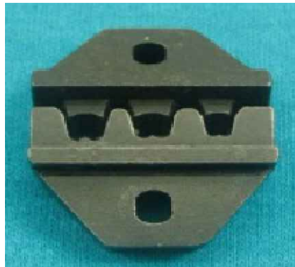
CRIMPING DIE(CA-AES-CT-15-DIE) DIE INSERT ONLY