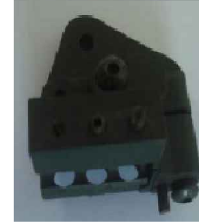
CRIMPING LOCATOR(CA-AES-CT-15-LOC) LOCATOR ONLY