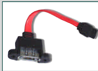
CA-U709054 Panel Mount cable assembly

Circuit Assembly's line of Serial ATA products has expanded to include External connectors and cable assemblies.