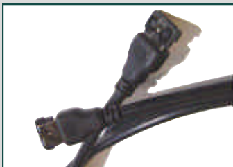
CA-U709045 Standard ESATA cable assembly

CA's high quality cable assemblies are available in multiple configurations, providing standard and custom solutions to your connection challenges.